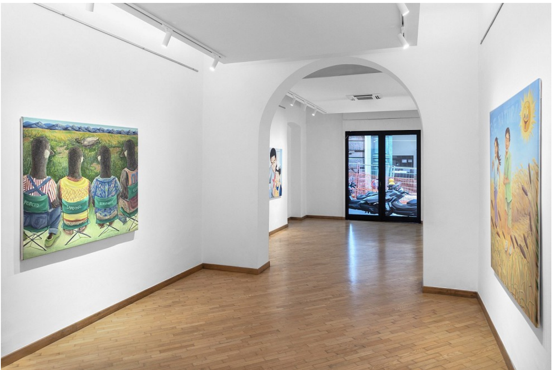
Same Day Service Installation view