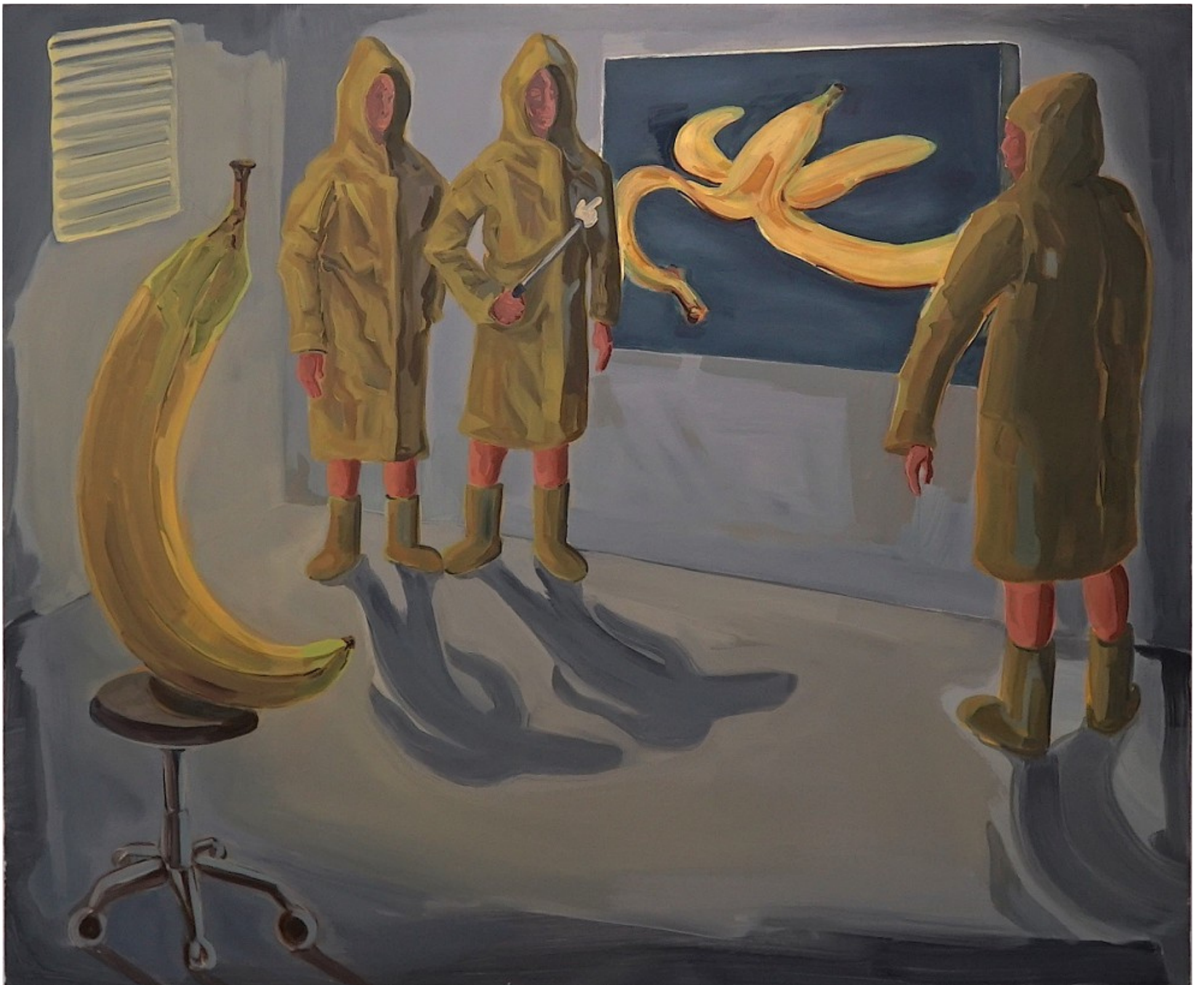
“Session II”, 2021 Oil on canvas 35 x 42 in