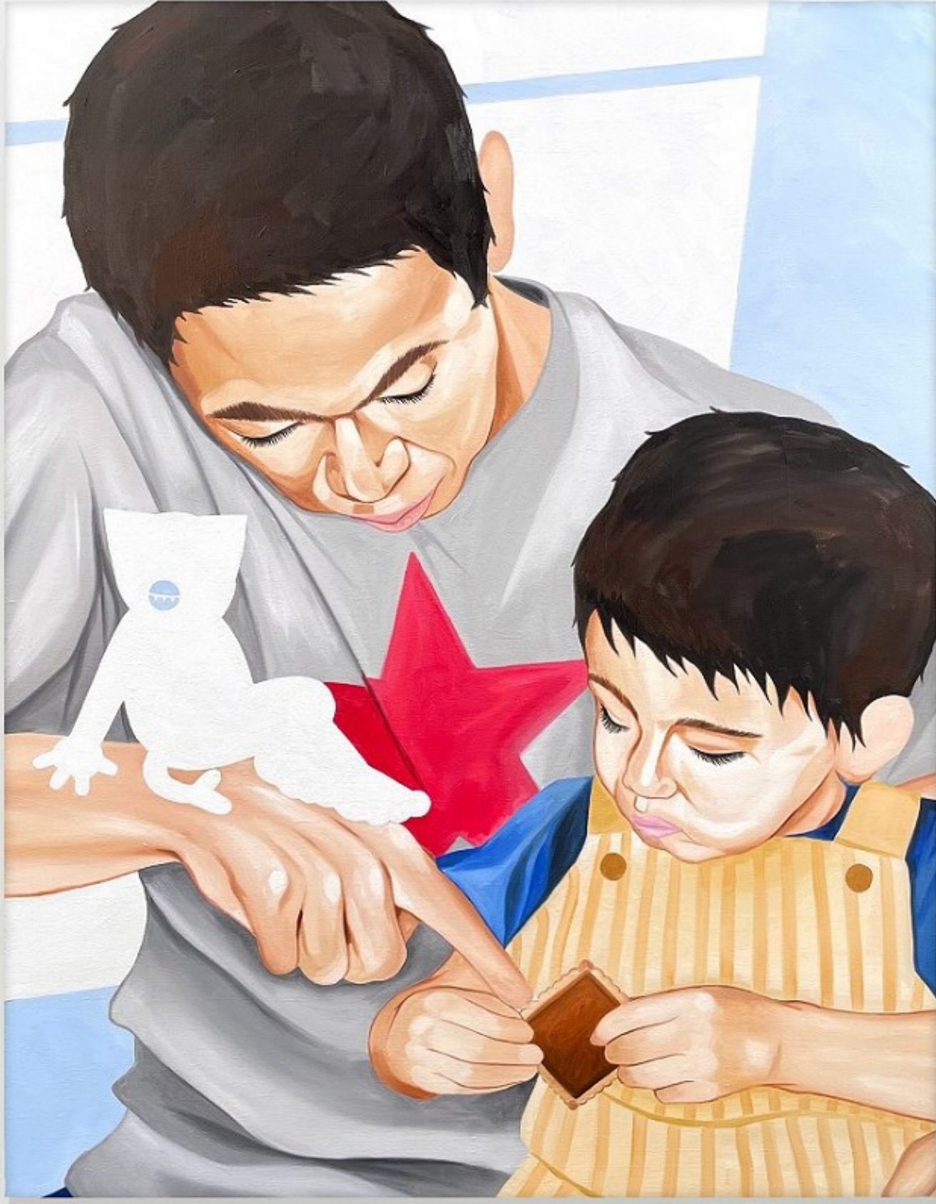
Victor Takeru “The Ballad of Victor Takeru part.1”, 2023 Oil on canvas 45 x 35 in