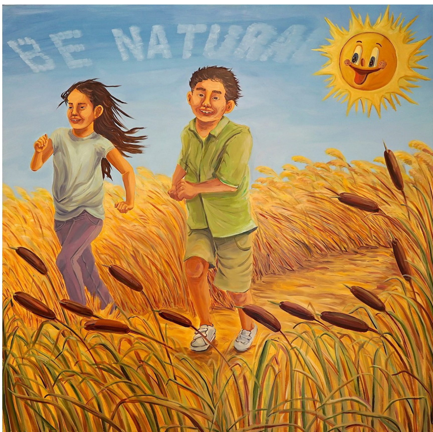
“Be Natural”, 2021 Oil on canvas 60 x 60 in