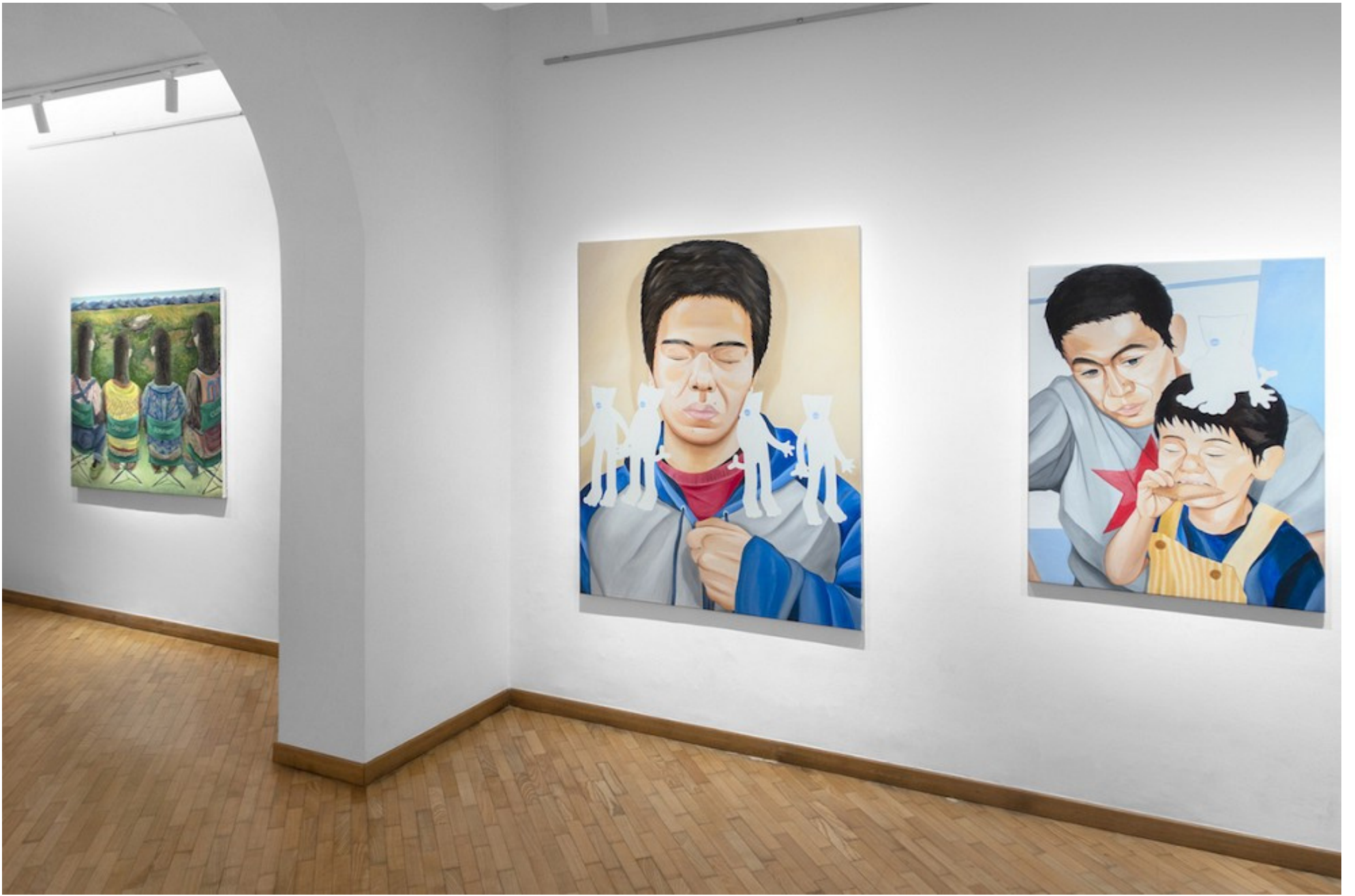
Same Day Service Installation view