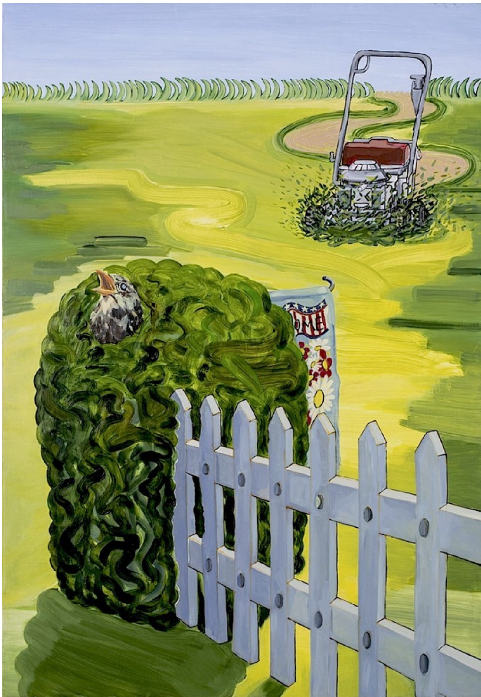
“New Born Baby”, 2021 Oil on canvas 46 x 32 in