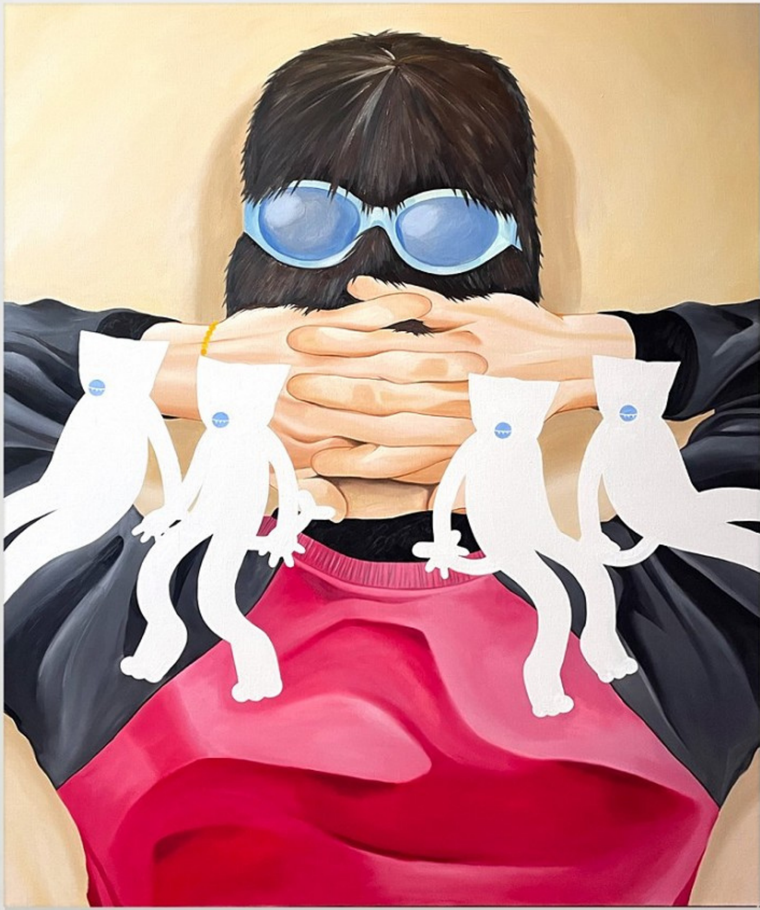
Victor Takeru “Still Laughing, Still Crying”, 2023 Oil on canvas 63 x 51 in