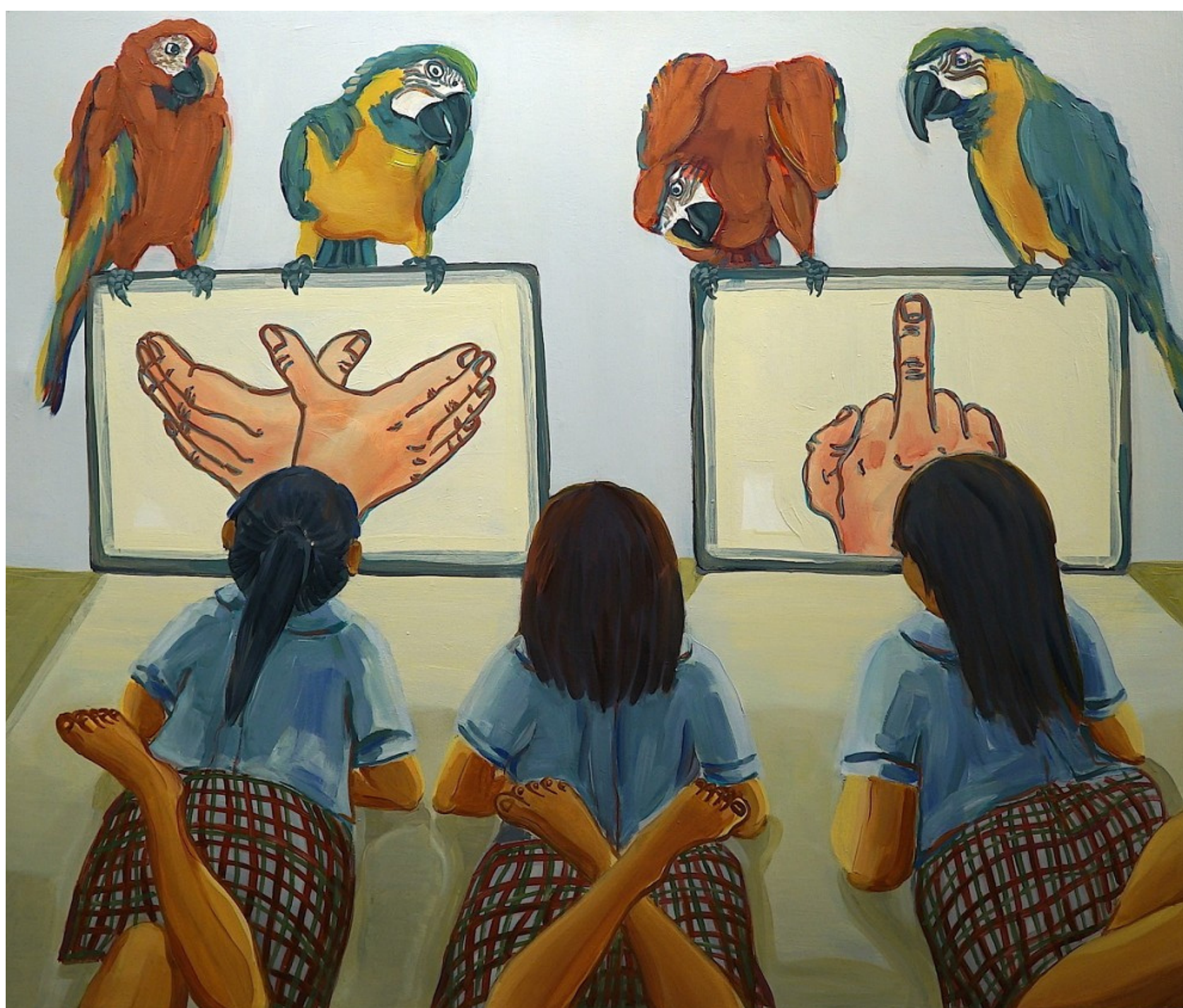
“Session I”, 2021 Oil on canvas 30 x 36 in