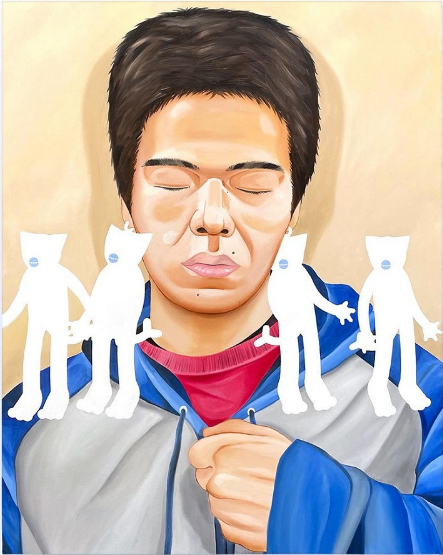
Victor Takeru “No Laughing, No Crying”, 2023 Oil on canvas 63 x 51 in