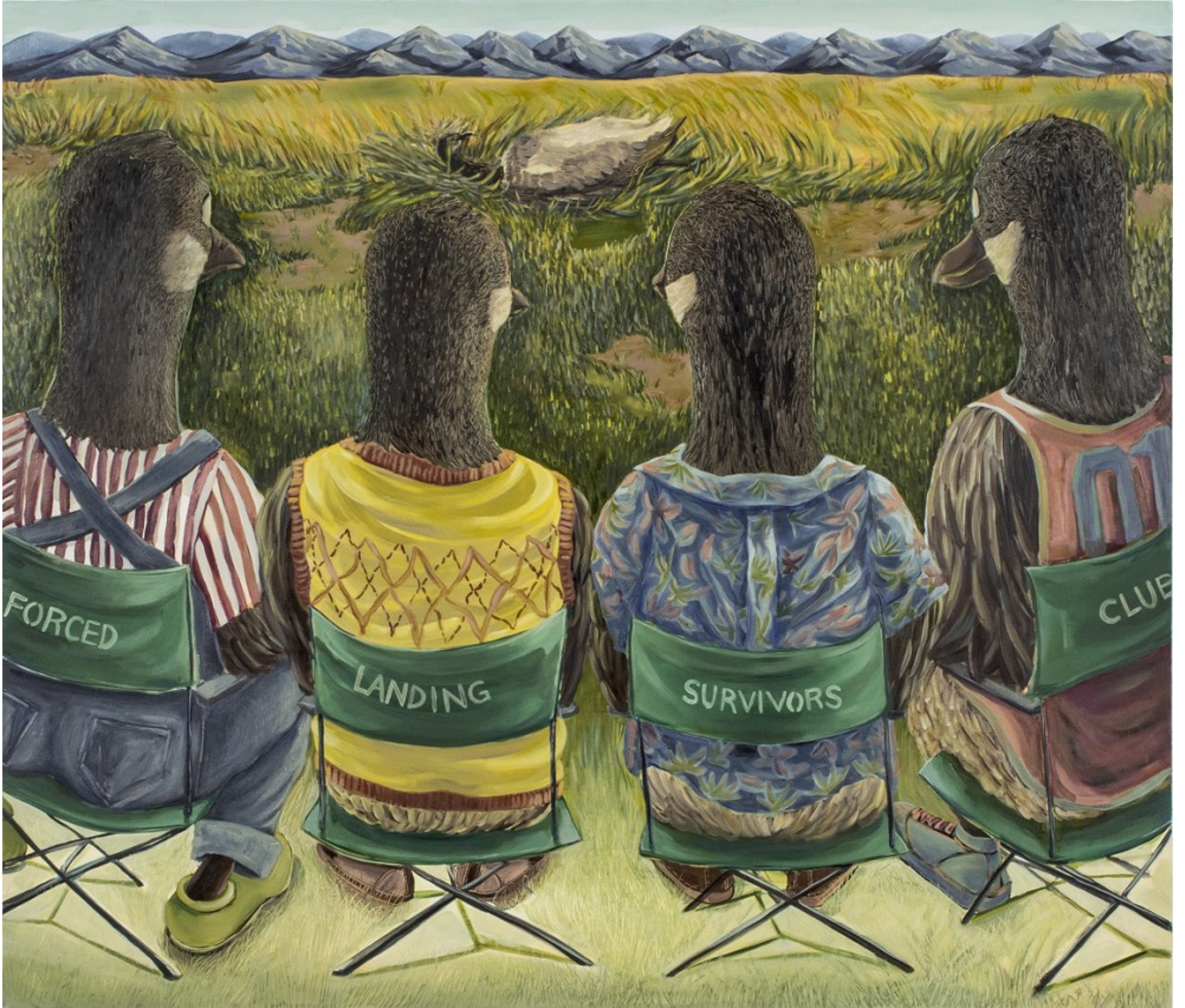
“Sightseeing”, 2022 Oil on canvas 48 x 56 in