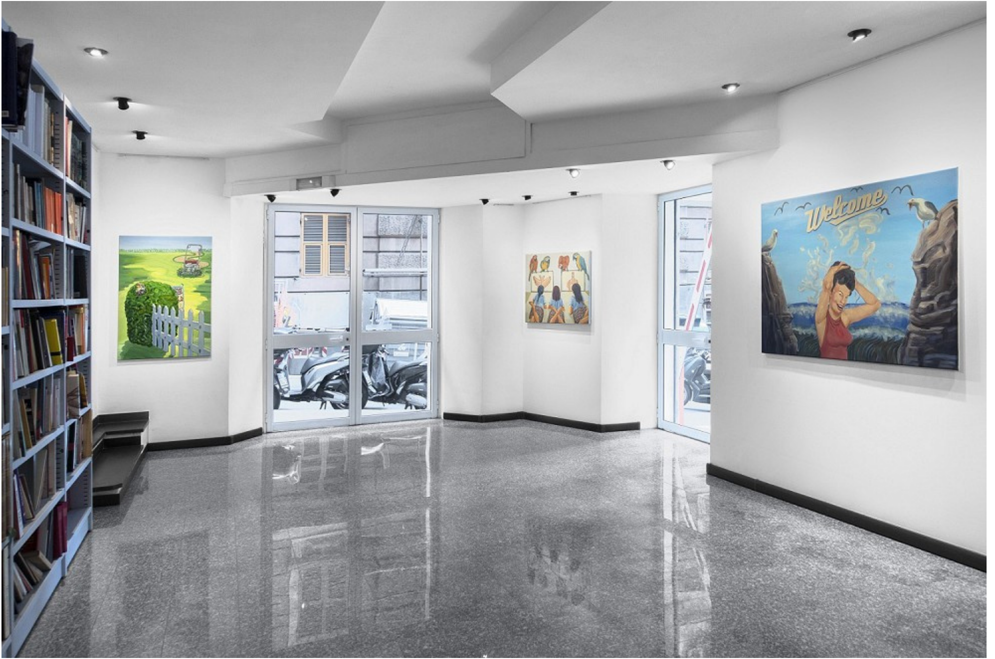
Same Day Service Installation view