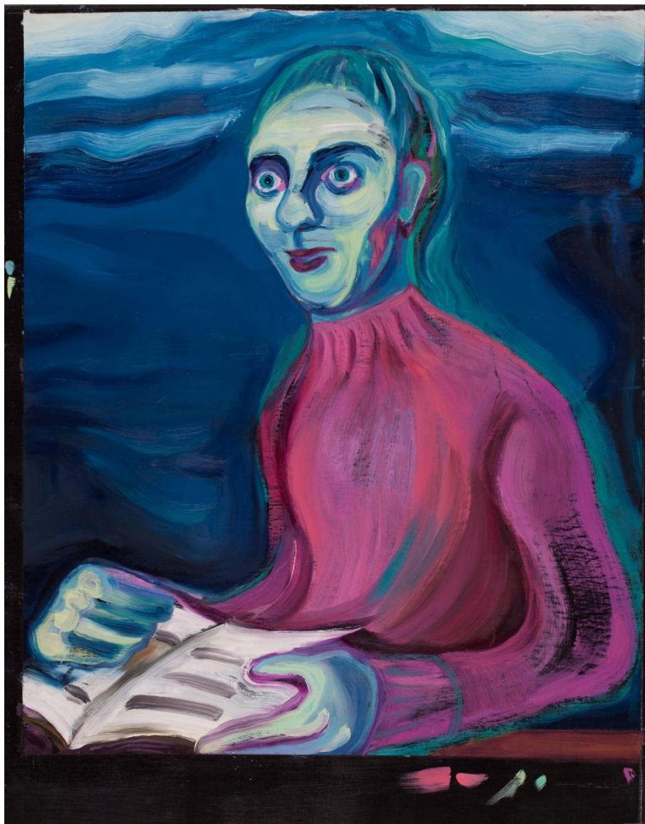
Can't Find the Words, 2020