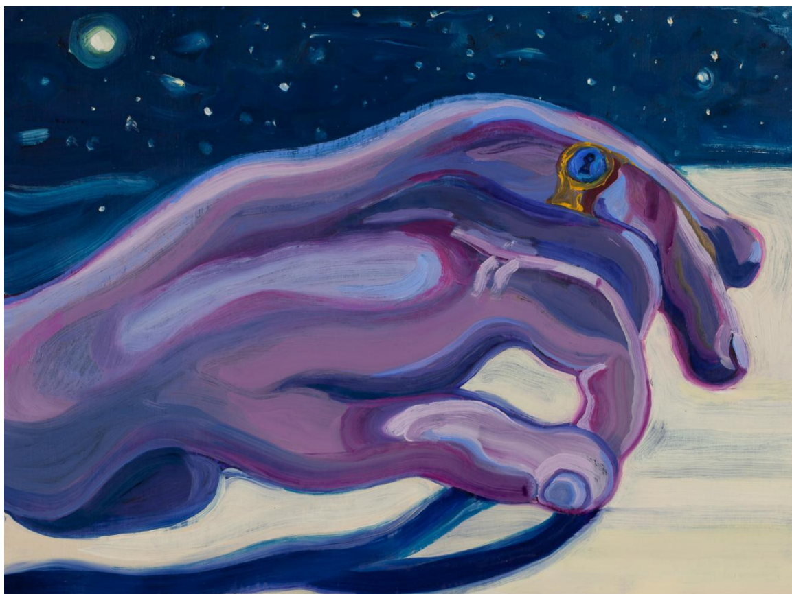
Hand Land, 2020