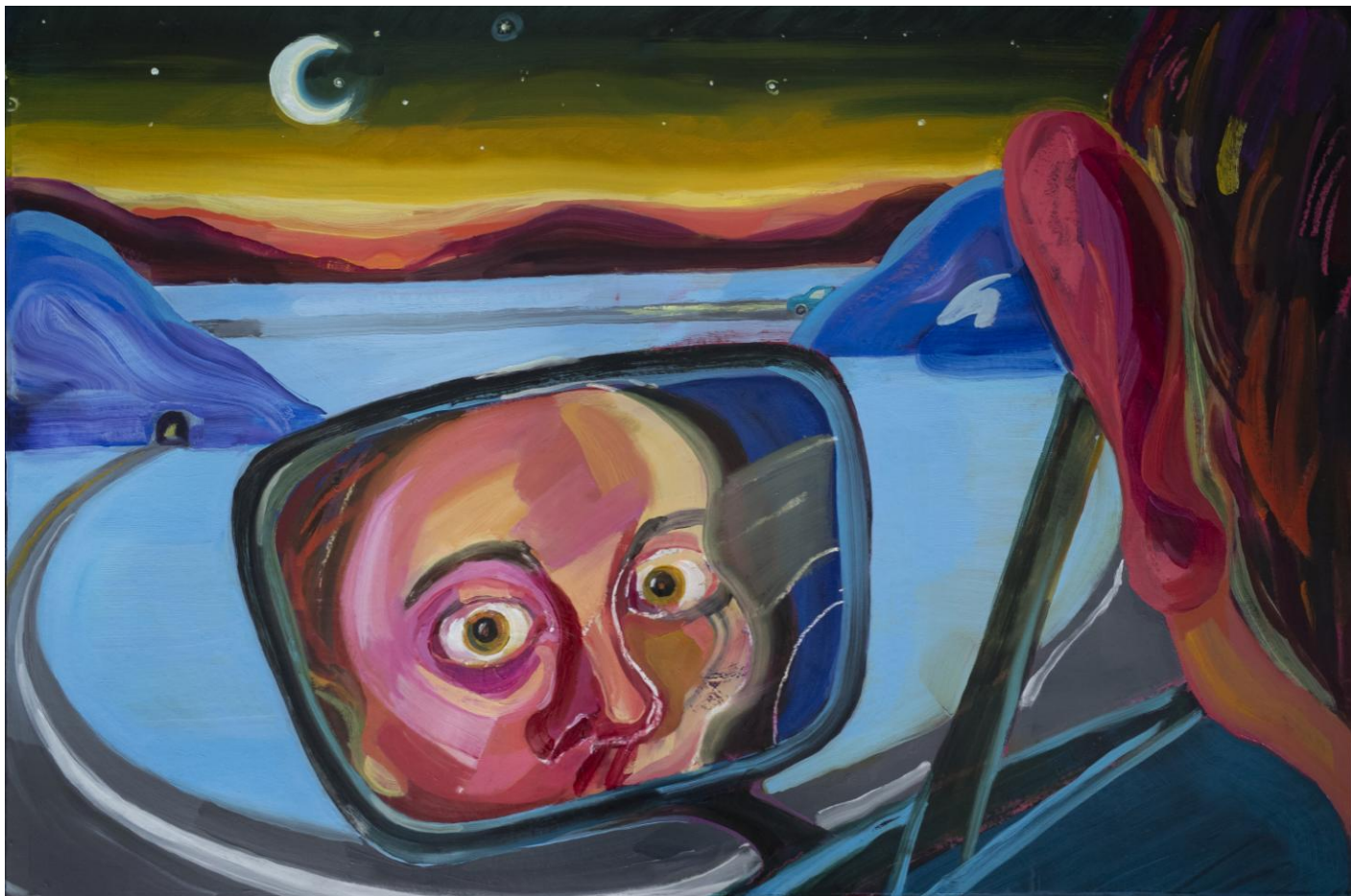
Wherever You Go There You Are, 2021