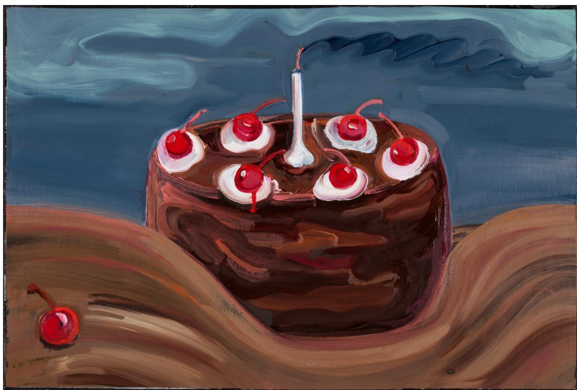
Cake After Rain, 2020, Oil on rag board 45 x 67 cm