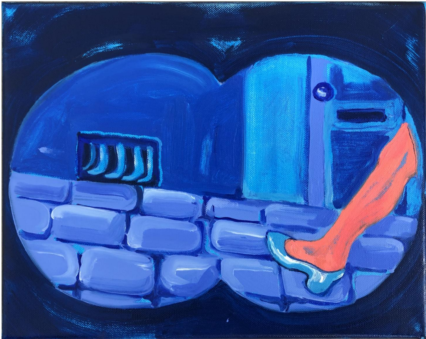
Your Heart Will Hunt You Down, 2019