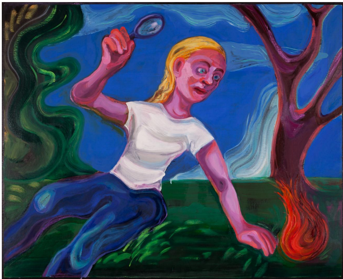
Vanity , 2020 Oil on rag board 81 x 102 cm