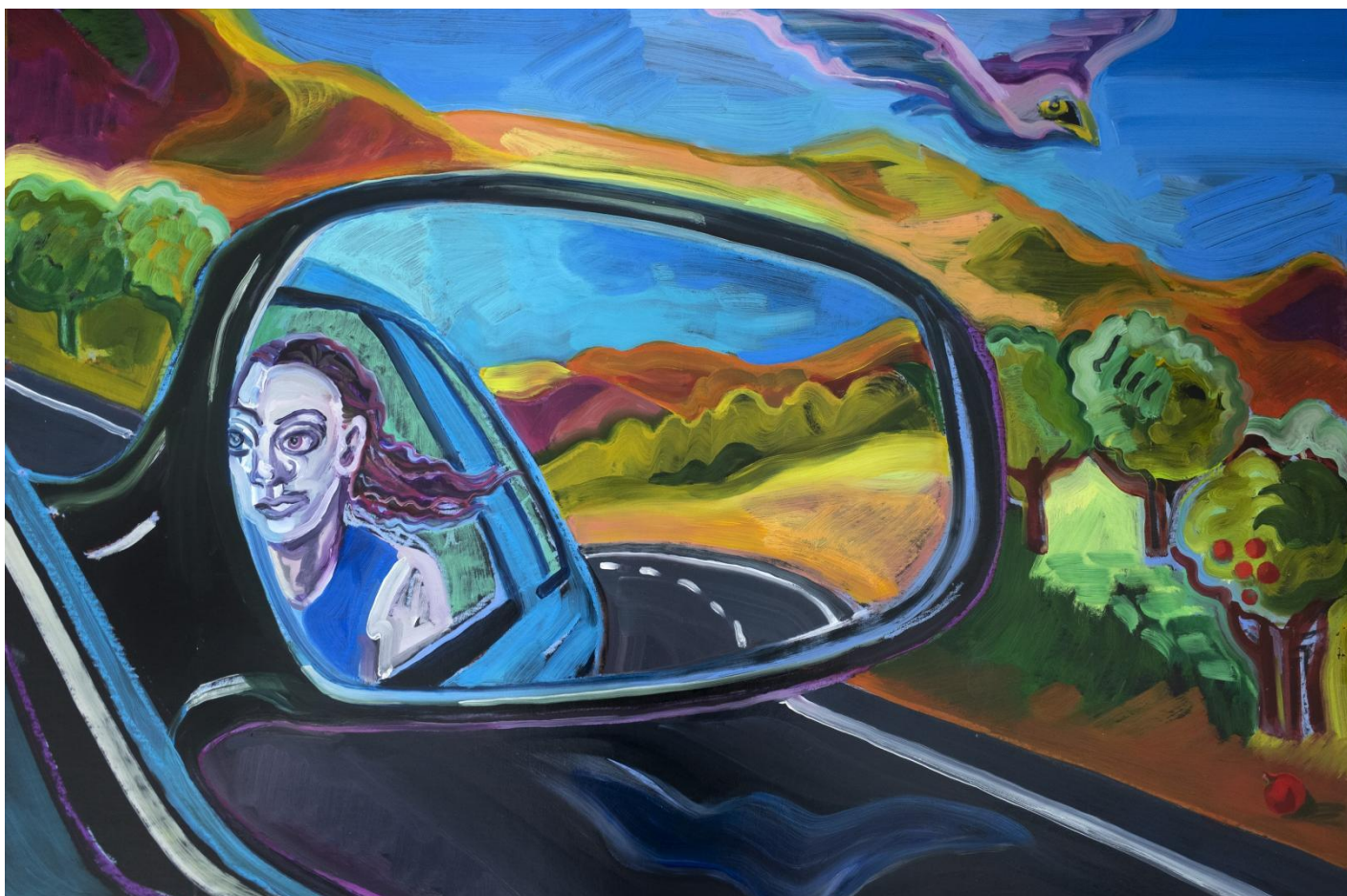
Flight, 2021 Oil on rag board 68,5 x 103 cm