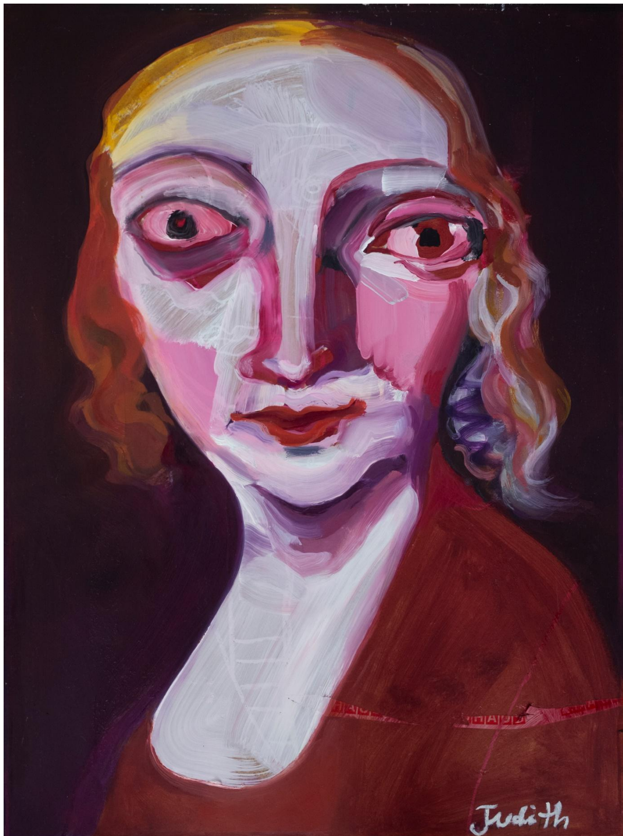
Judith, 2021 Oil on wood 57 x 42,5 cm