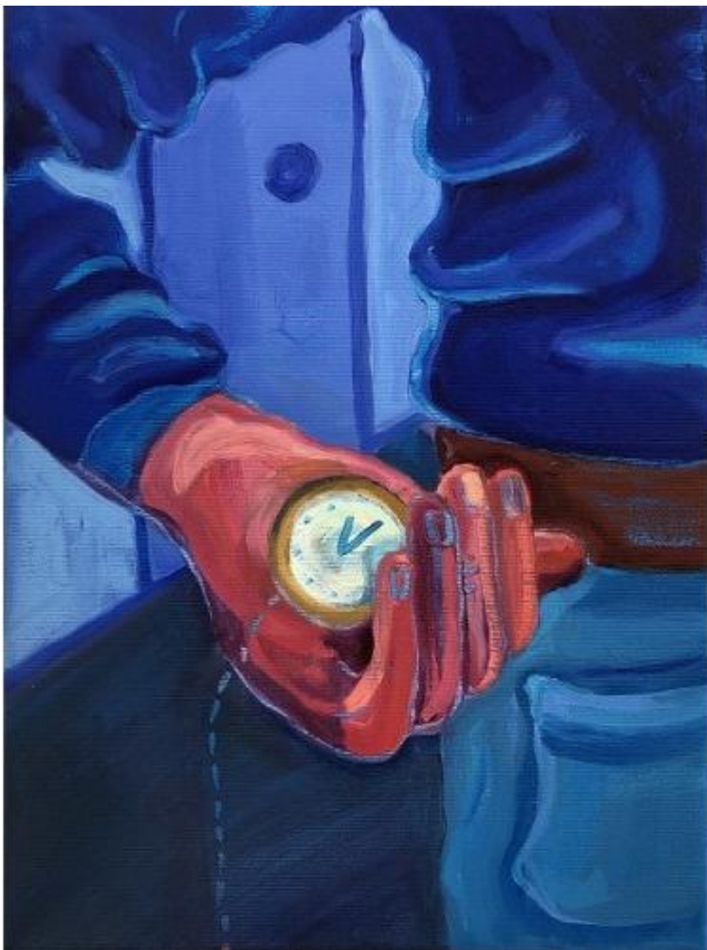
Take Best Care, 2019