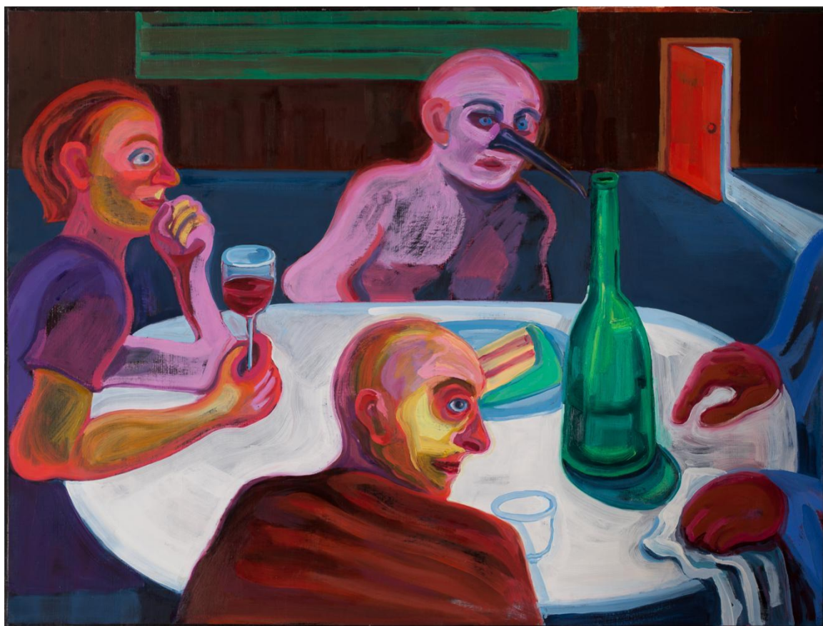
Temperance - Have your cake, 2020