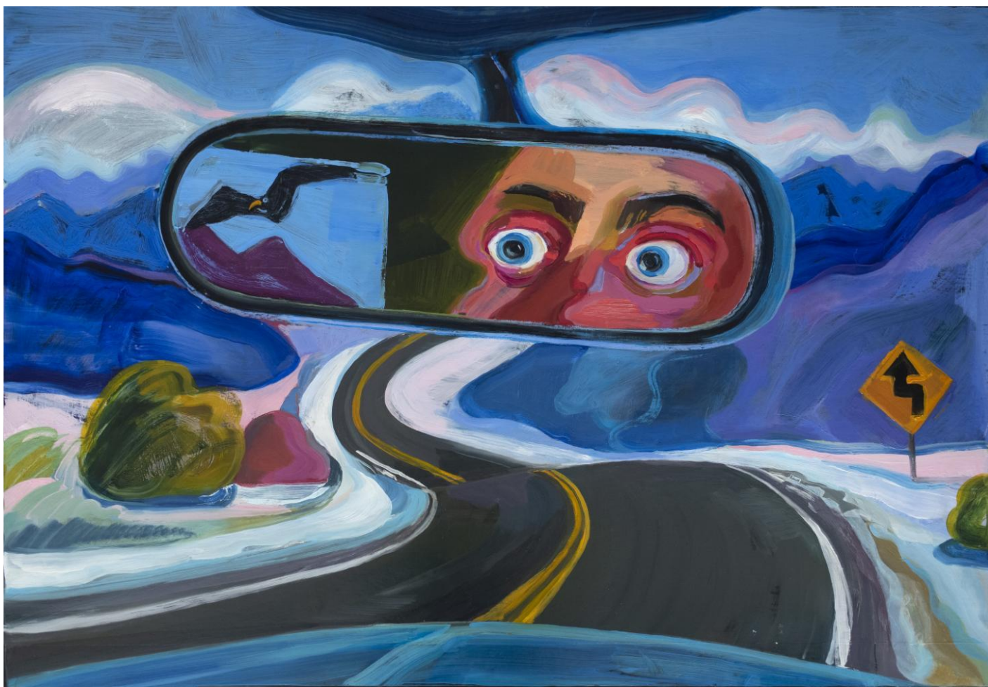
The Hunt, 2021