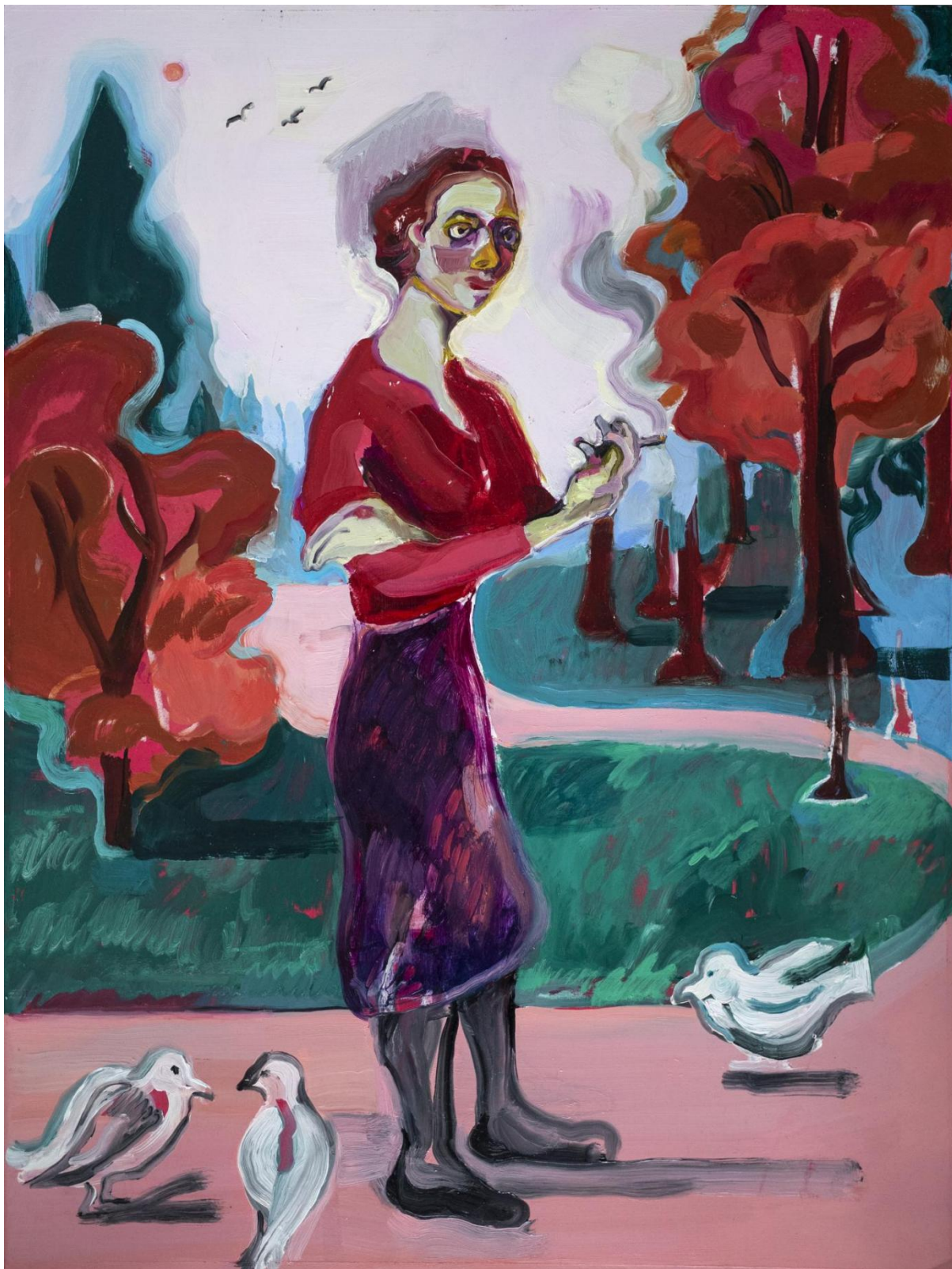
Killing Time, 2021