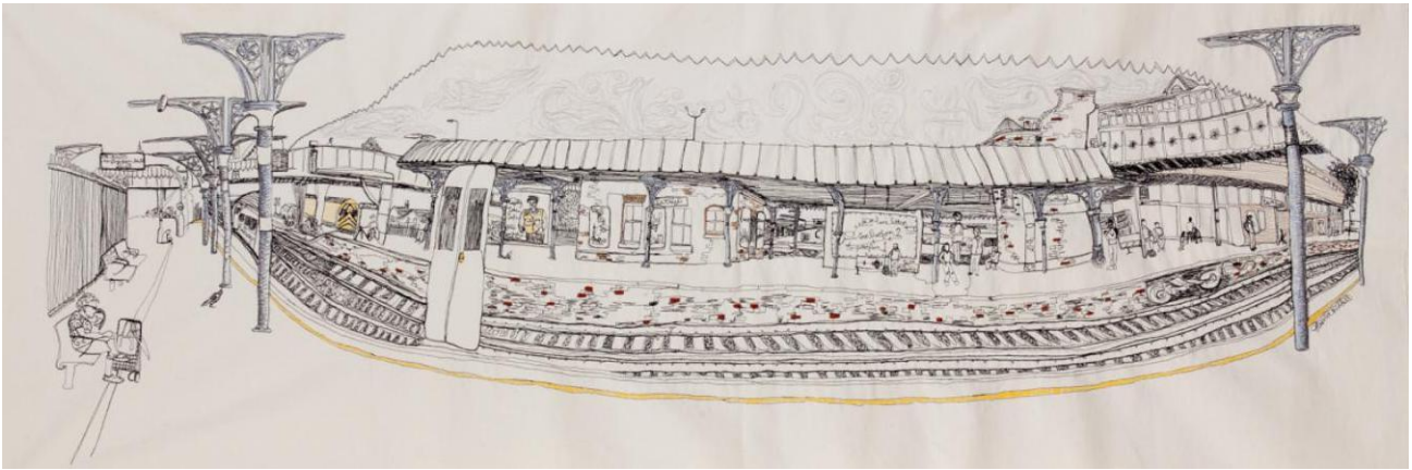
Stand behind the yellow line, 2021, machine stitched with applique 174 x 80 cm