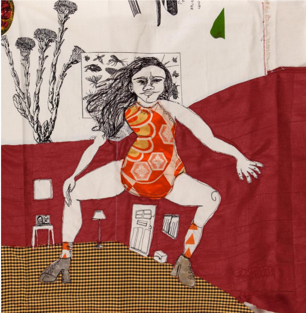
Stay at home, 2021 , machine stitched with applique 65 x 66 cm