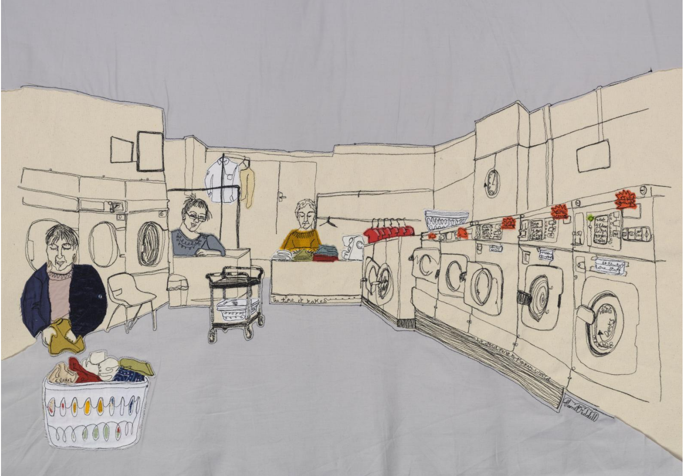
Mindy and Margaret, 2020 , Machine stitched with applique, 57 x 80 cm