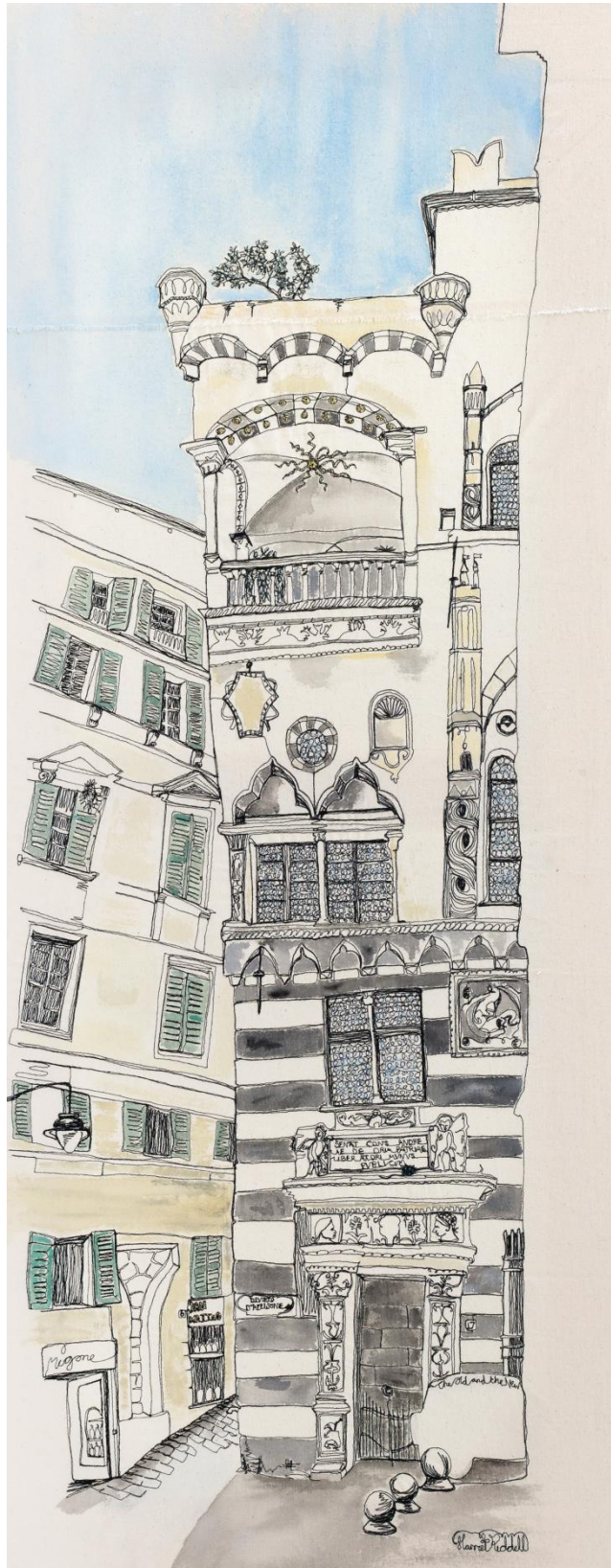
San Matteo, 2020, Machine stitched, 115 x 47 cm