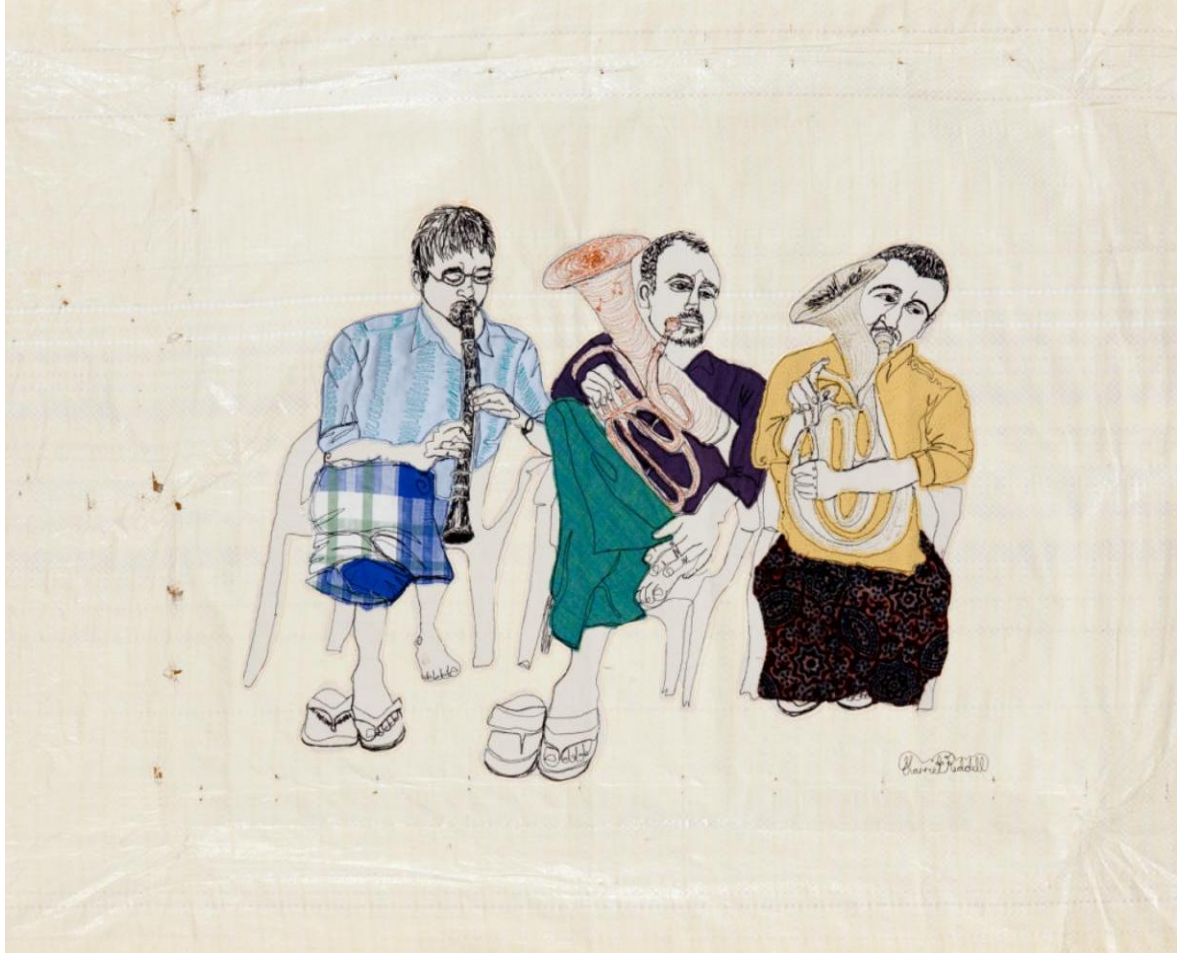
Band practise, 2021, machine stitched with applique 52,5 x 64,5 cm