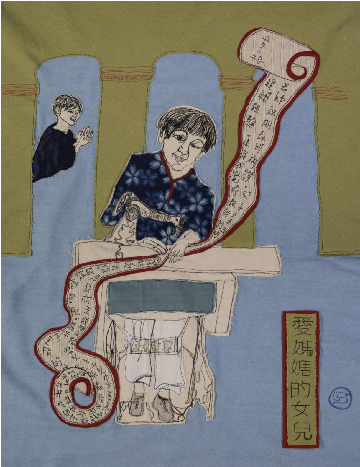
The Proud Daughter, 2020 , machine stitched with applique, 80 x 70 cm